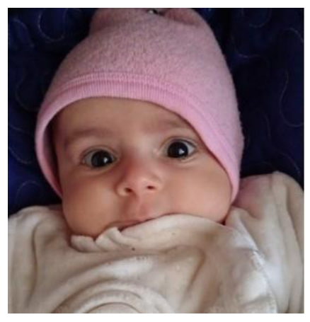
Figure 3. Photo of a child before using corticosteroids

Severe glaucomatous excavation was noted in the fundus of the right eye. There was a slight excavation on the left eye (Figure 2).