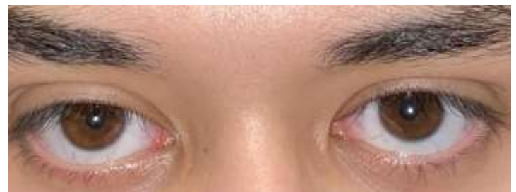
Figure 4. The eyes in symmetrical position.

In 2021, in the primary gaze position, the eyes were almost symmetrical (Figure 4). The patient has not worn glasses for a year.